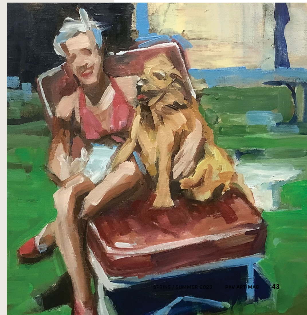
Ginger Maryanne Buschini Oil Painting 8" x 8"

Both—there are times I want the figures to communicate a specific emotion—one that I see in the resource material or one that I emphasize in the painting. There are also times I find that exaggerating, blurring, obscuring, or repeating a face or gesture helps to emphasize an idea to bring a piece together. ■